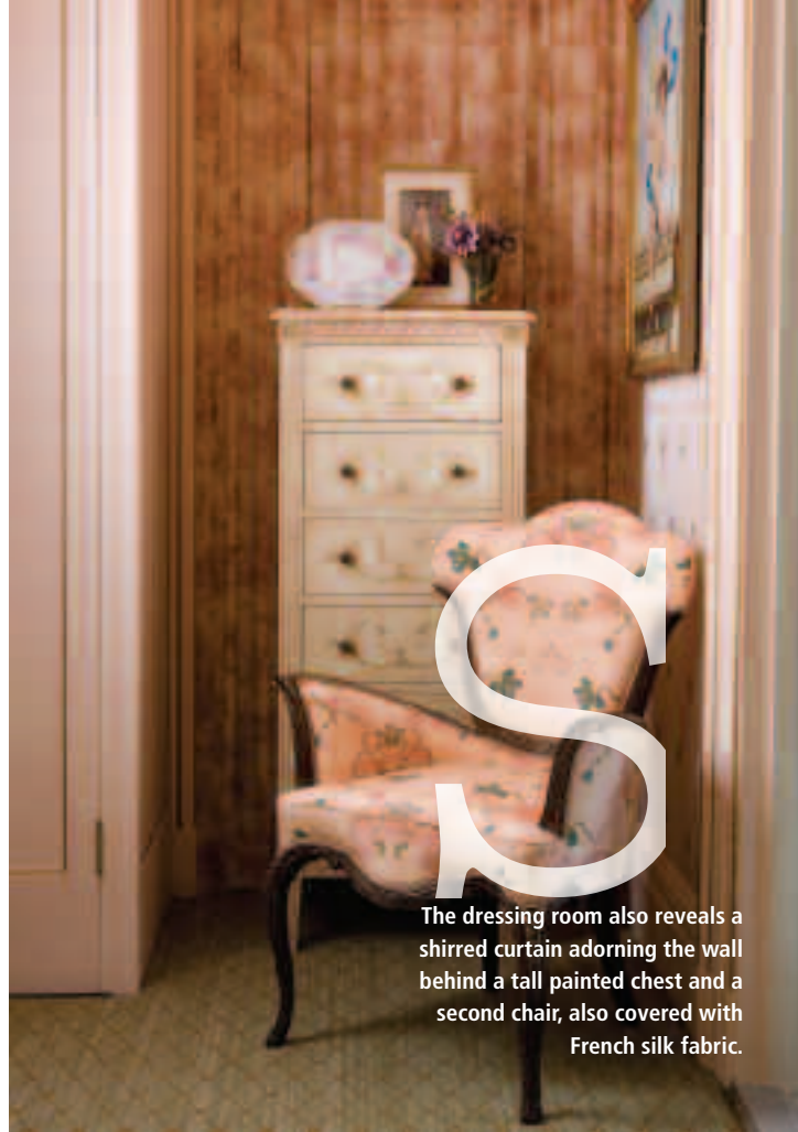
The dressing room also reveals a shirred curtain adorning the wall behind a tall painted chest and a second chair, also covered with French silk fabric.