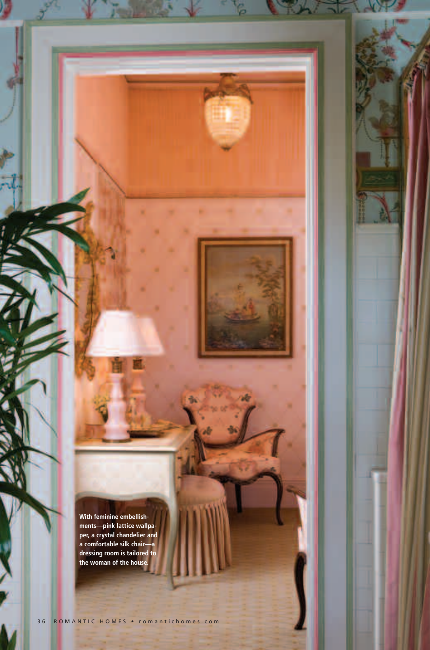
With feminine embellishments—pink lattice wallpaper, a crystal chandelier and a comfortable silk chair—a dressing room is tailored to the woman of the house.